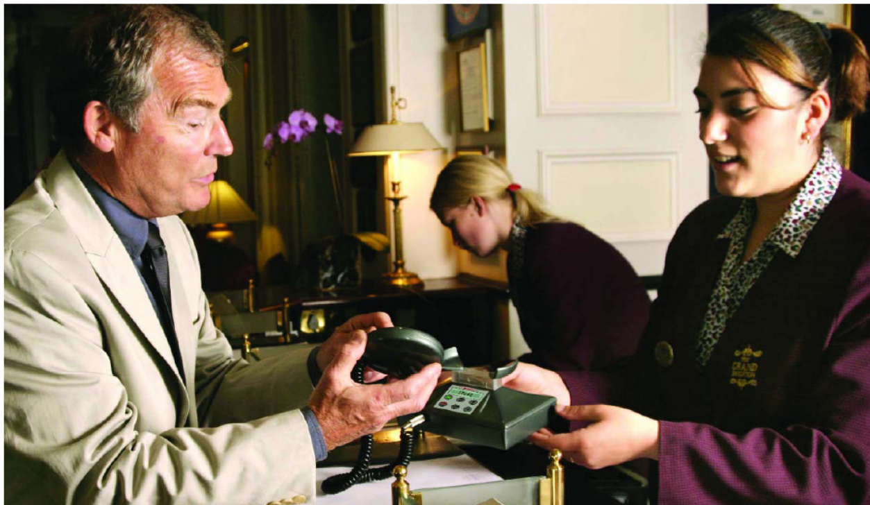
▼ Deafgard units can be handed over to guests upon check-in.