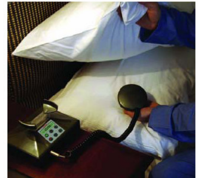
▲ The Deafgard vibrating pad sits discreetly beneath a pillow.

It listens for the fire alarm, allowing people to sleep, rest or simply relax safely without the inconvenience of always having to wear their normal hearing aid.